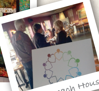
South Beach House