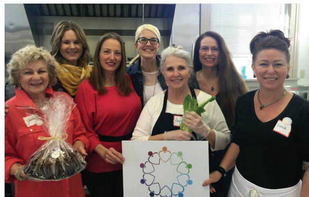
Craft Fairs serving food

To that end, we are working on expanding our volunteer base and collaborating with PREP, CARE, the Food Bank and Fire Department. Our call to all of you is simple: join us.